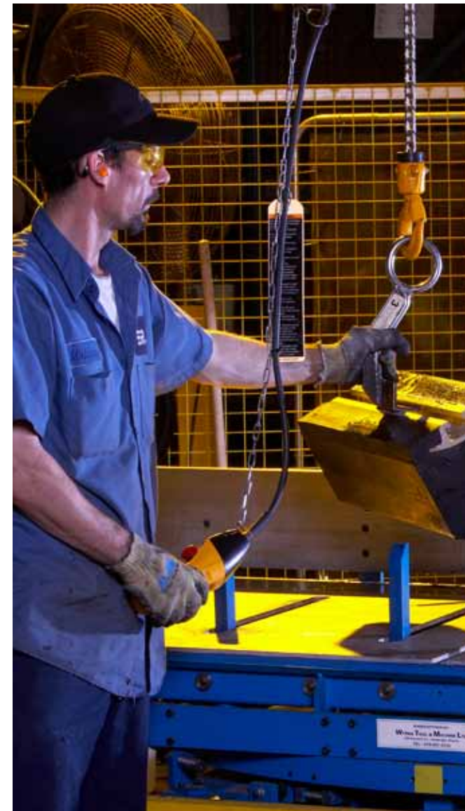
Mining finishing saw