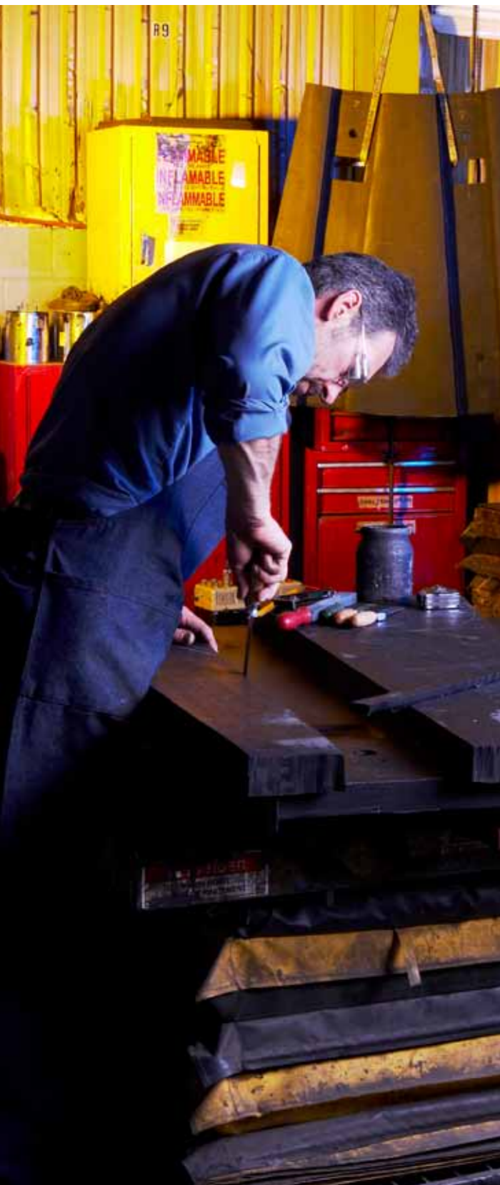
Mining hand lining