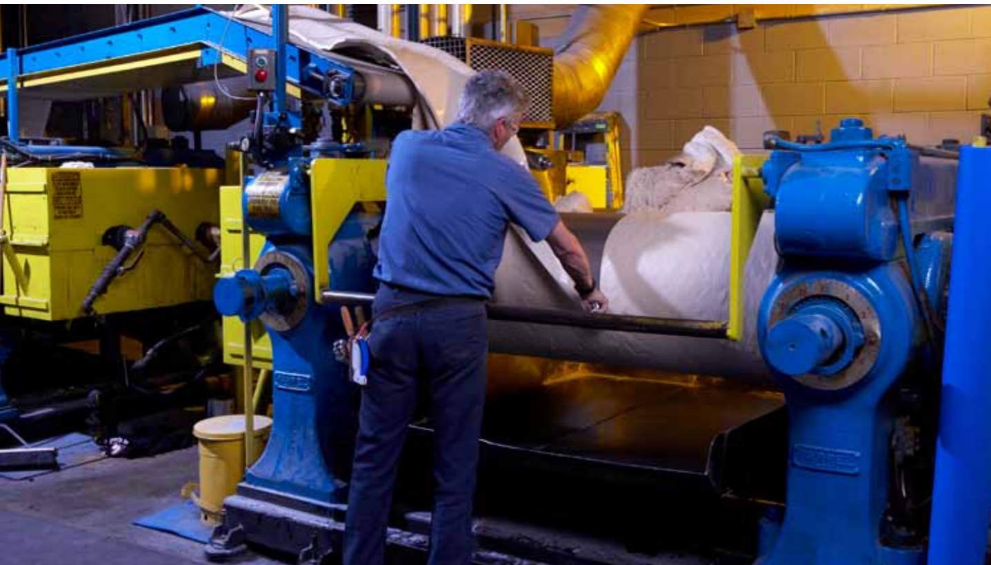
Protective linings warming mill

says Haber. In these markets, developing local agents with a good understanding of the mine operations is a key.