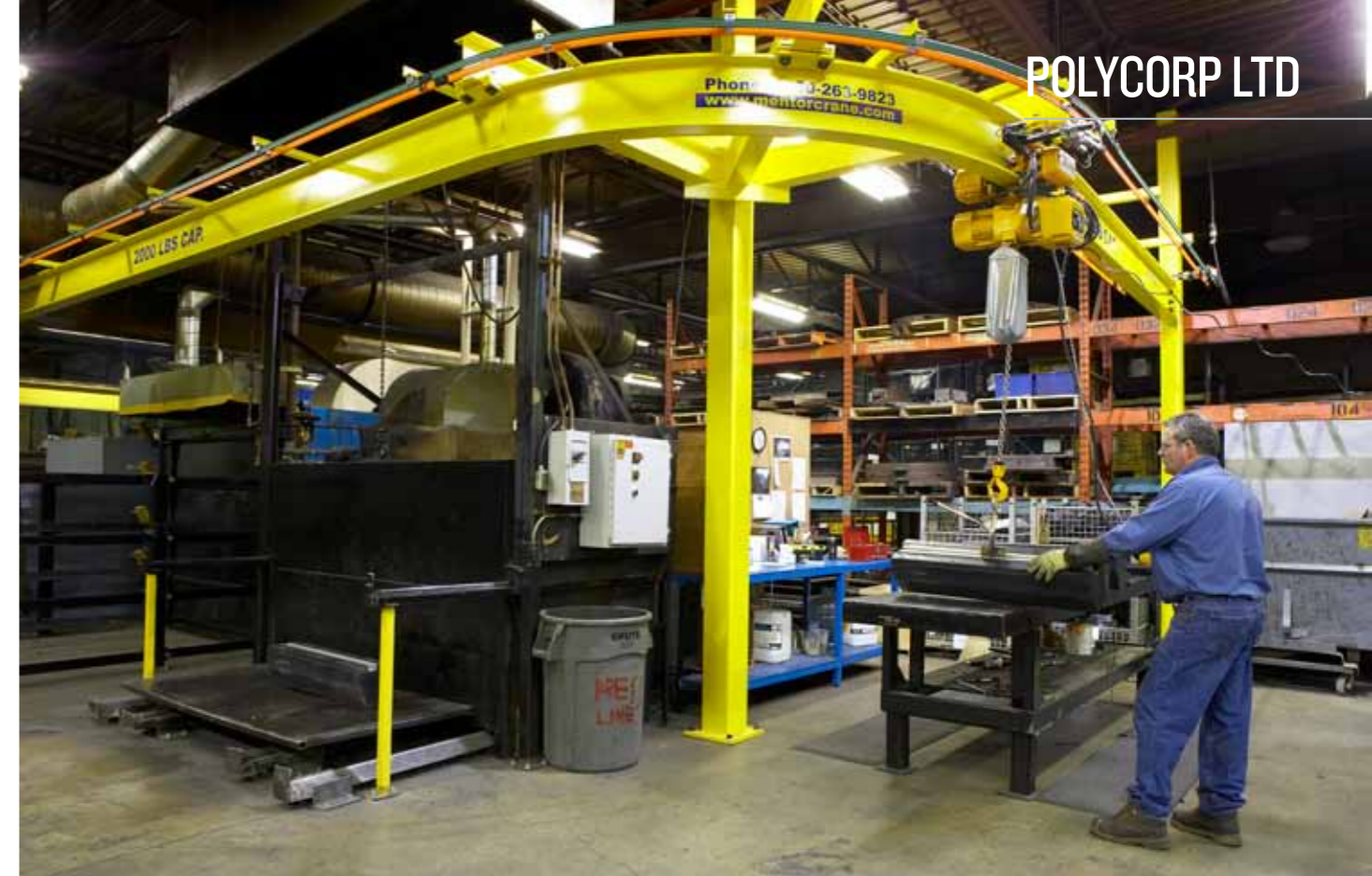
Mining press line post curing

The Protective Linings division is where Polycorp’s chemistry expertise comes in strongest. It has a huge portfolio of over