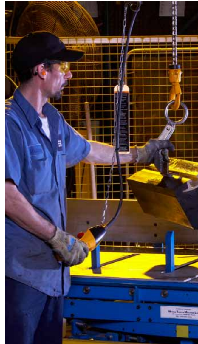
Mining finishing saw

systems to protect the mill shell and to enhance the movement of the ore slurry for optimum throughput and grinding performance. Mill liner replacement is a critical part of the entire mining operation. If the mill stops, the whole process stops. It is critical that the mill liners achieve the required service