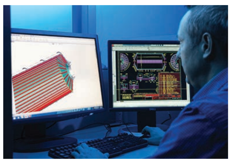
An engineer 3D models a mining mill liner.

"The Mennonites have no electricity, there's no TVs, no lights. I don't know how the whole system works, but I was brought