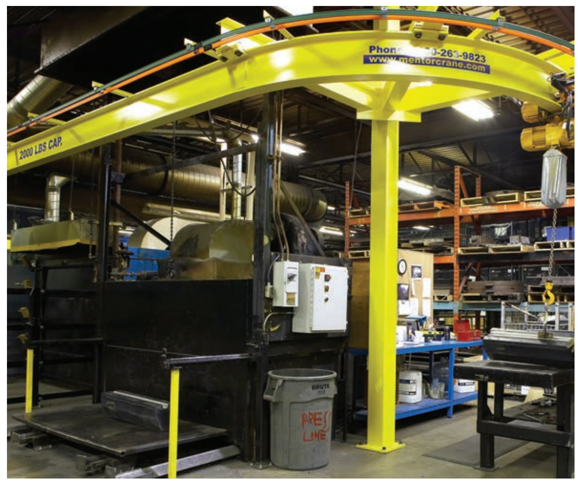
Polycorp's 3D moulding, secondary curing and finishing operations.

That approach has earned the company a reputation around the world as the go-to supplier for elastomeric products. Its PolyStl mill liners were the subject of a technical paper produced by a mining client that revealed they were giving its mills – around the