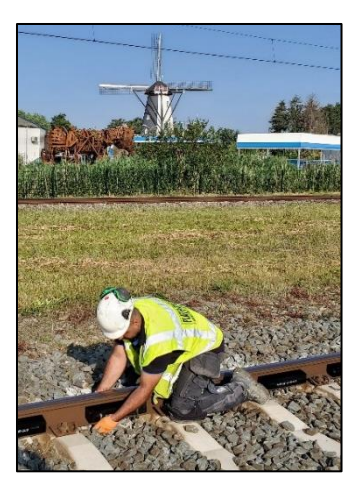
2019 TMD Installation - Holland

Already demonstrated in the demanding markets of Europe, with several successful installations in the Netherlands, Polycorp also received the prestigious Dekra 3<sup>rd</sup> Party Certification for their noise attenuation properties. As a significant additional benefit, Polycorp's TMD's were verified to prolong the service life of the rail by reducing rail corrugation and rail maintenance by delaying the need for costly grinding.