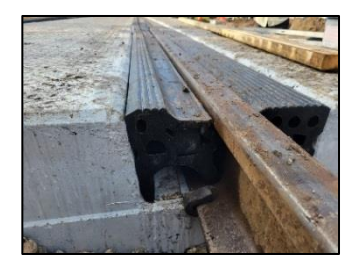
Seminole Gulf Railway Florida

Polycorp's patented Shallow Flangeway "Safety" Railseal installed in Seminole Gulf Railway network in Florida, USA was specifically developed to increase grade crossing safety and reduce or eliminate unnecessary accidents and fatalities (the US reported 237 deaths in 2021 alone – (https://oli.org/track-statistics/collisions-casualties-year). Polycorp's Shallow Flangeway also meets all Disabilities Act requirements in both Canada and the US.